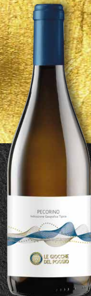
PECORINO TERRE DI CHIETI IGP