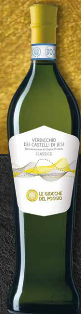
VERDICCHIO DEI CASTELLI DI JESI DOP | Classico

THE WISDOM OF EXPERIENCE AND THE PRIDE OF THOSE WHO PRODUCE WITH THEIR OWN HANDS