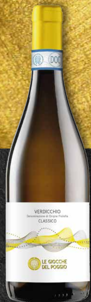
VERDICCHIO DEI CASTELLI DI JESI DOP | Classico