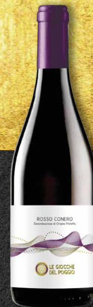
ROSSO CONERO DOP