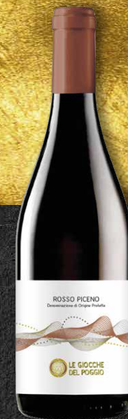
ROSSO PICENO DOP