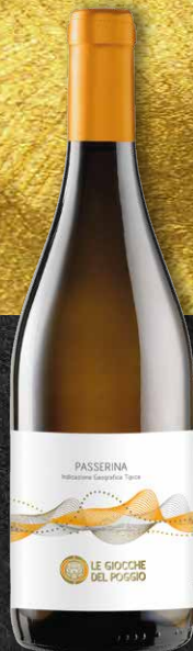
PASSERINA MARCHE IGP