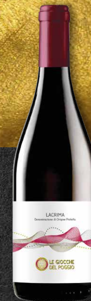
LACRIMA DI MORRO D'ALBA DOP