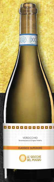
VERDICCHIO DEI CASTELLI DI JESI DOP | Classico Superiore